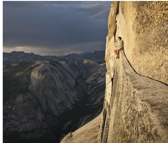
This is a Homo Sapiens-Crazy Guy competing for a Darwin Award.