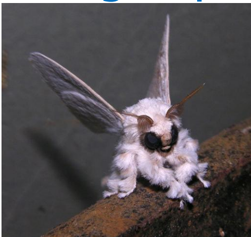
This is a Venezuelan Poodle Moth first found in 2009.